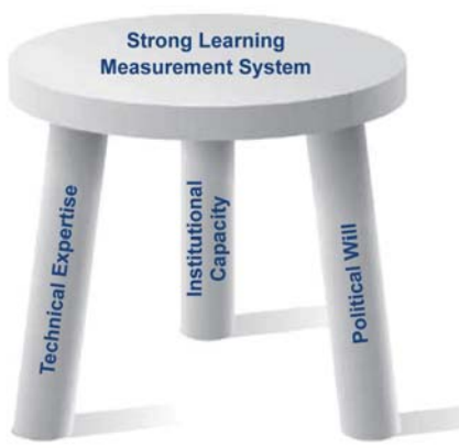
Figure 3: Three Key supports for a strong learning measurement system.

This section briefs the major points, which the taskforce has presented describing the key supports countries need to develop and sustain robust assessments of learning that can help inform improvements in policy and practice — implementation of measurement of learning to improve education quality. Quality education and learning are the responsibilities of multiple stakeholder groups, including governments, civil society and the private sector. An effective and efficient measurement system plays a vital role in quality education. In order to implement an assessment system that is both country-owned and internationally relevant, countries and other governmental units can benefit from collaboration, sharing and support. For this to happen, the task force has identified three key supports that are necessary for a successful learning measurement system that are in high demand